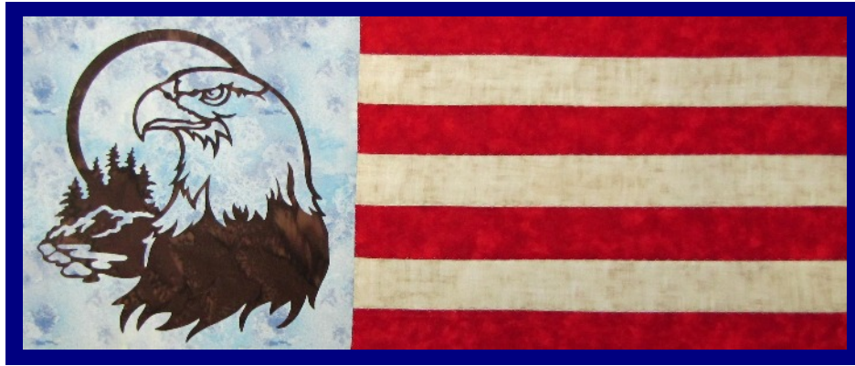
Table Runner or Wall hanging

Designed by Doris Deutmeyer - Fabrications by Doris