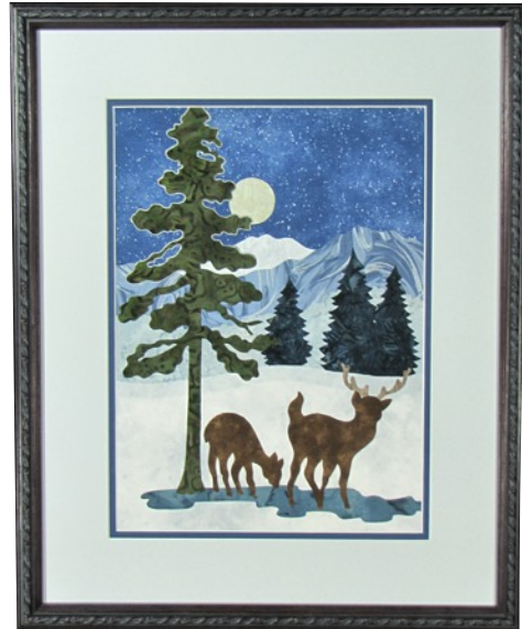
"CRYSTAL NIGHT" Completed size 11" x 15"

Fused Applique is an exciting and easy technique for creating fabric landscapes. In this class you will learn raw edge applique method, how to choose your fusible and fabric, tools for success, and finishing methods. Get inspired with samples of creative display options.